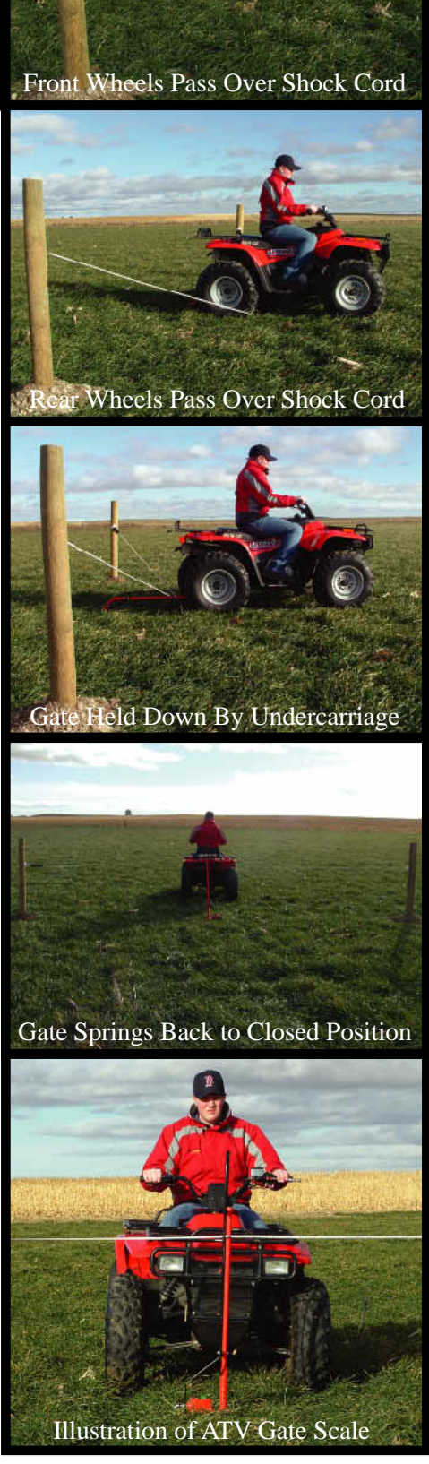
© 2005 by Pivotal Fencing Systems, LLC All rights reserved

10092 County Road 36 - Yuma, CO 80759 Phone - 970-848-5500 Fax - 970-848-3420 www.pivotpost.com